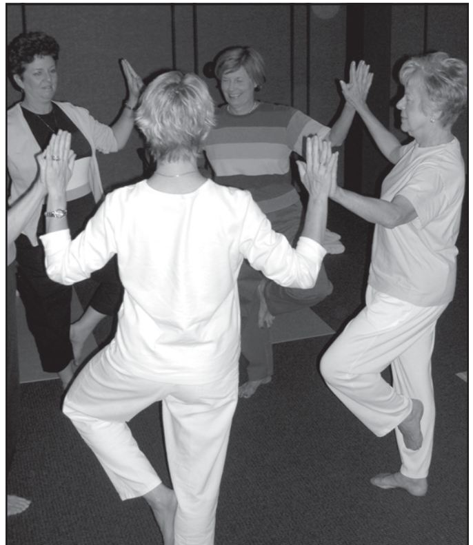
Photo 1. Yoga students practicing a group âsana .

pants practice shavâsana in a chair, and others lie down. Participants are asked to observe how the body and breathing feel, with attention to thoughts and feelings. They are asked to watch these states with acceptance and benevolent curiosity, and without undue involvement in what arises.