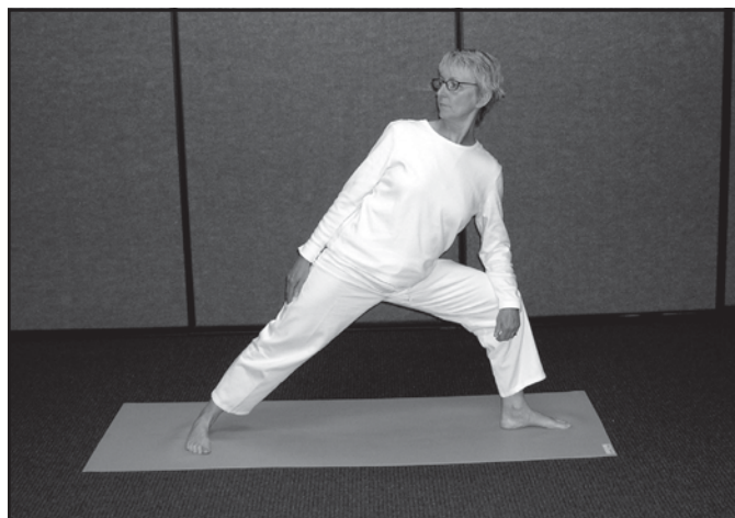
Photo 3. Modified parsvakonasana.

ance issues. Typically, students in this course can move up and down from the floor unassisted. Compared to Therapeutic Yoga classes, Gentle Yoga tends to serve individuals with less chronic or serious disorders, but may include individuals with musculoskeletal disorders such as fibromyalgia, mood and sleep disorders, and chronic pain syndromes. Gentle Yoga classes follow the same general format and philosophy as the Therapeutic Yoga course.