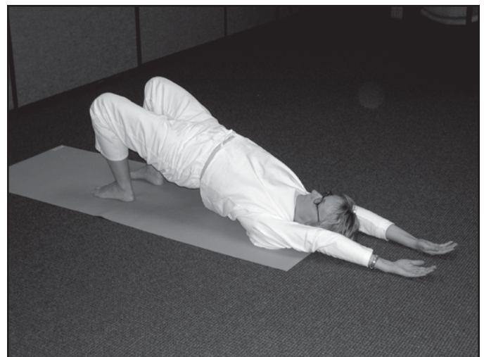
Photos 4-7. Rolling Bridge Series.